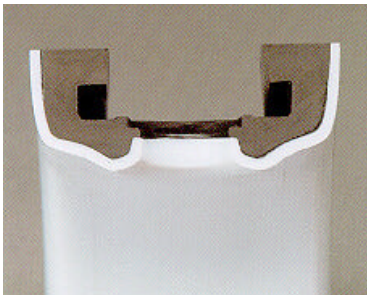
Seat cross-section at stem hole

BRAY'S UNIQUE SEAT DESIGN is one of the valve's key elements. The elastomer backed PTFE seat features a tongue and groove retention method which holds securely between either slip-on or weld-neck flanges and also allows simple and fast field replacement. This EPDM backing provides resilient support for the molded PTFE, thus maximizing the shut-off and cycle life of the seat.